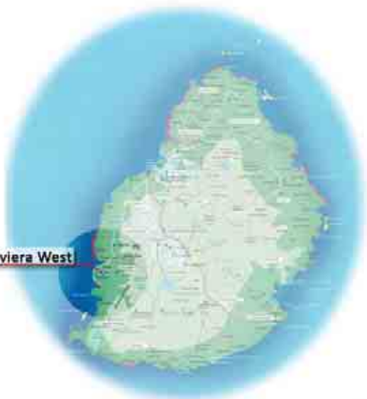
Site Riviera West